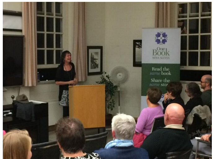
Cake and great attendance at the St. FX reading!